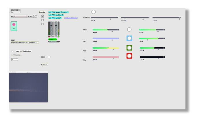
Figure 3 Flight Variant Max patch in presentation mode