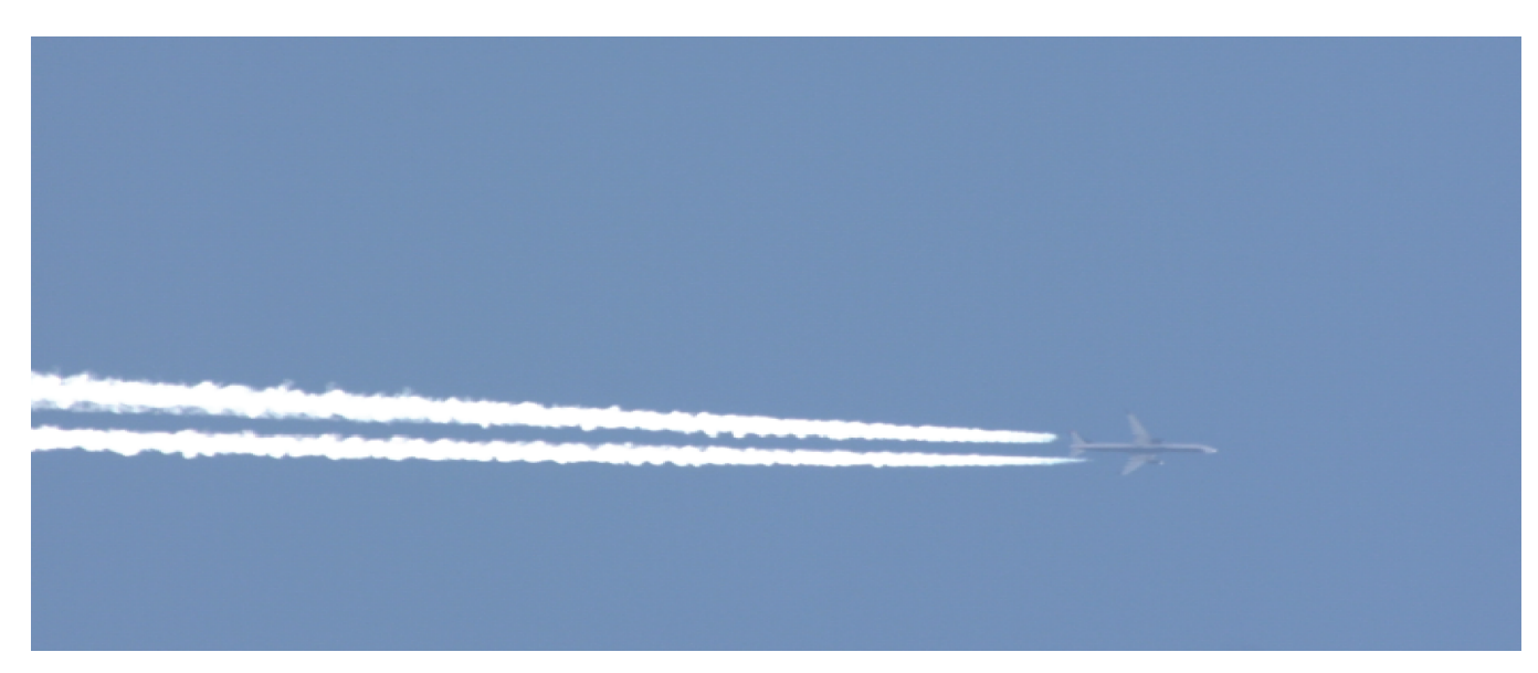
Figure 1 Flight Variant—installation image.

Link to Teresa Connors's CV and web page: https://waikato.academia.edu/TeresaConnors www.divatproductions.com